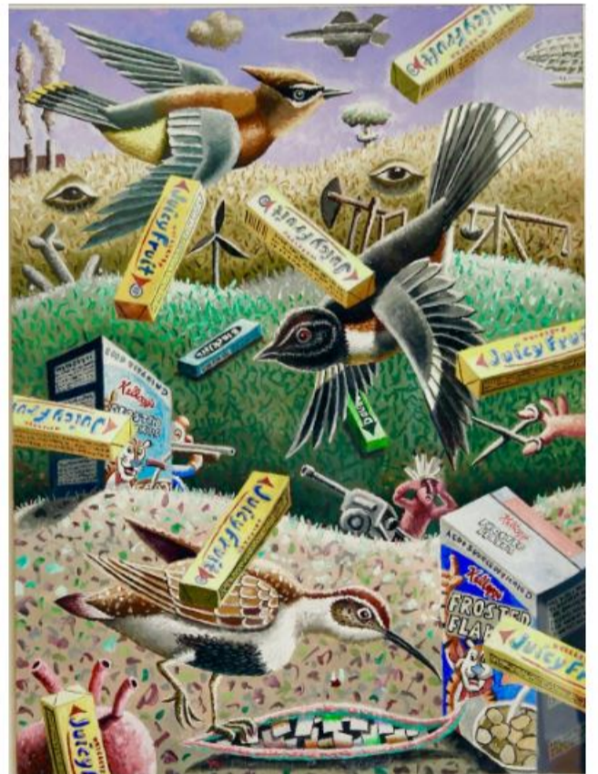
Gouache on Arches paper, 9 x 12 inches each